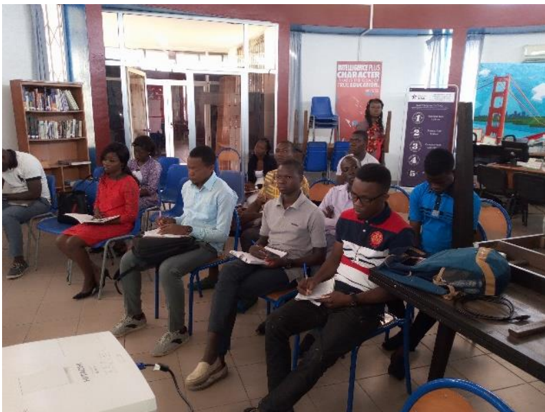
Book Club participants, very attentive